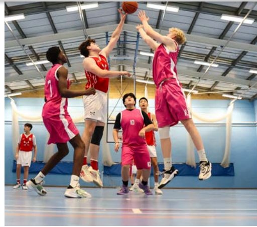
Basketball vs Abingdon