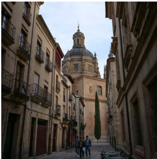
Salamanca Music Tour