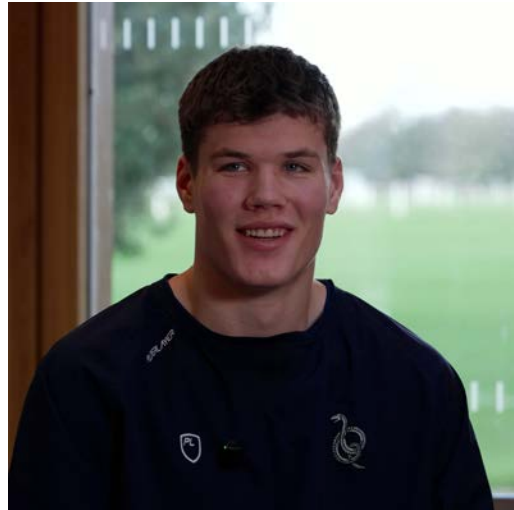
A Moment of Me