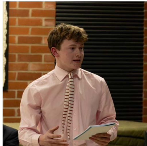
Radley Union Debate