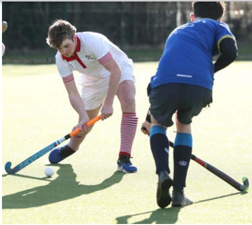
Hockey vs Teddies