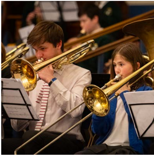
Preview: Mighty Orchestra