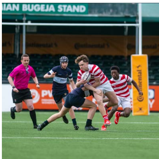
U15 Schools Plate