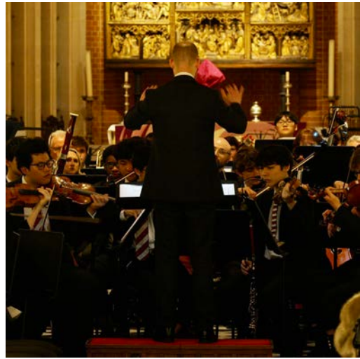
Preview: Gala Concert