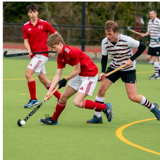
Galleons Day 2025