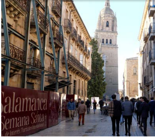
Salamanca Music Tour