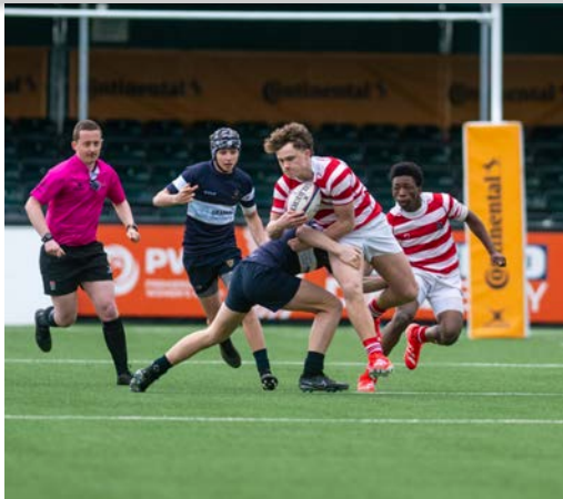
U15 Schools Plate