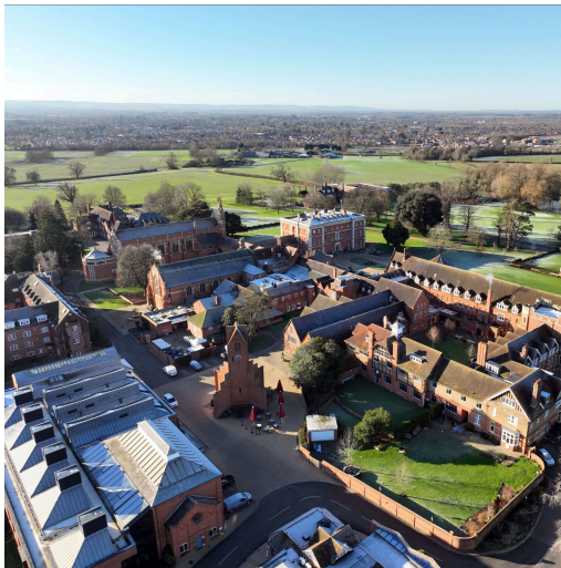
Campus from the Air