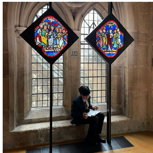
Shell Art Trip