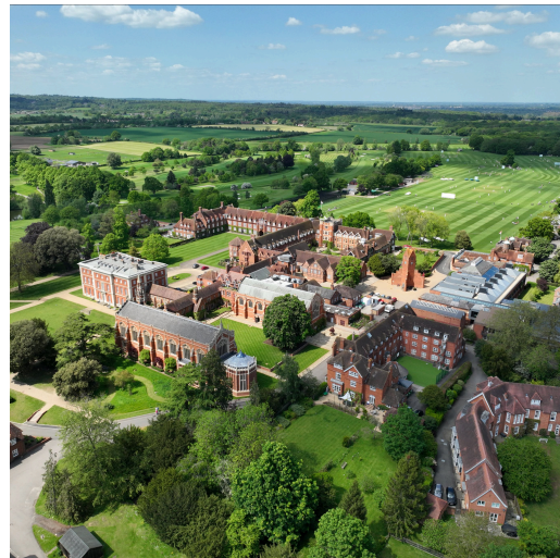
Radley Tour Film