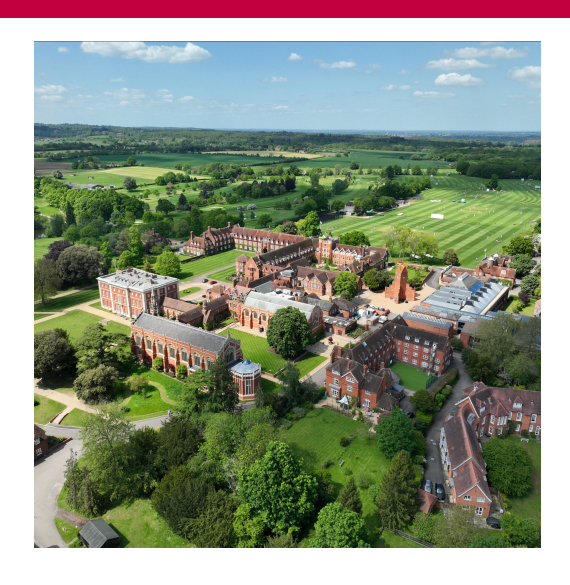
Radley Tour Film