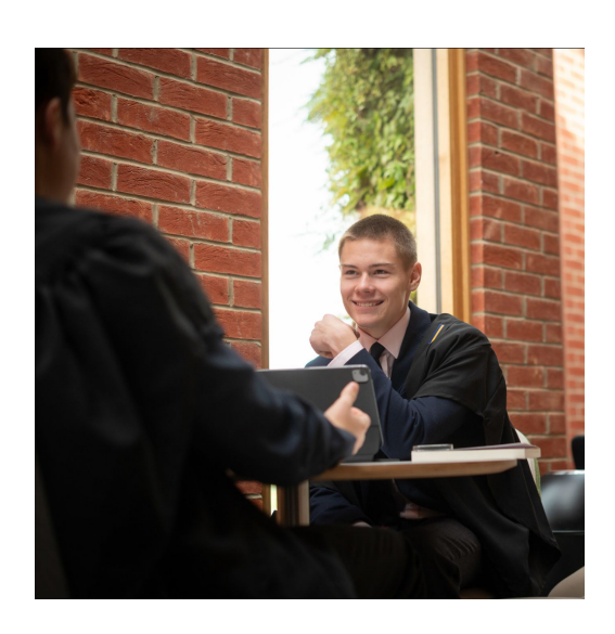
Campus and Shop