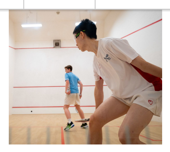
Squash vs Eton