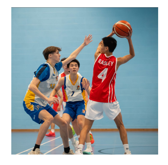
Basketball vs Stowe