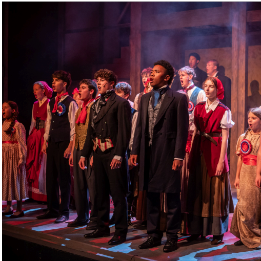
Les Mis Highlights