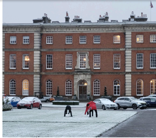
Radley in Winter