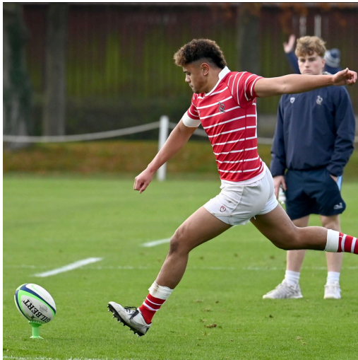
Rugby vs Oakham

We are grateful to all our professional, staff and boy photographers who work hard to capture the true essence of Radley. As ever, all photographs are available to download from Flickr .