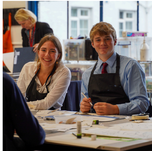
Art with Downe House