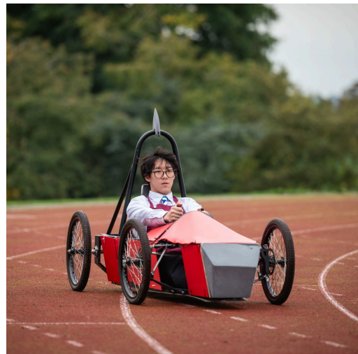
Green Car Challenge