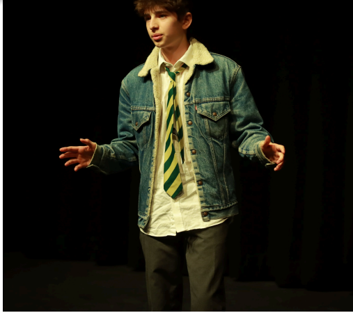
Haddon Cup Winner