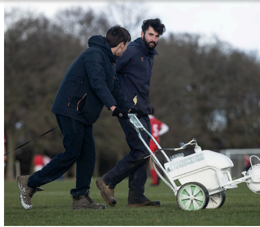
Working at Radley