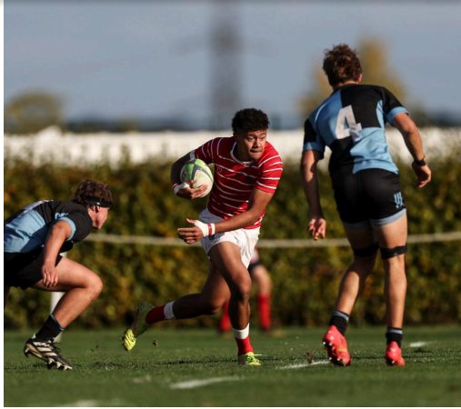
Rugby vs Eton