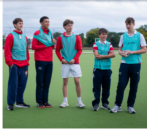
Sport Leader Training