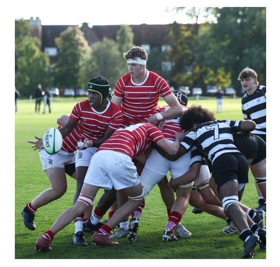
Rugby vs Tonbridge