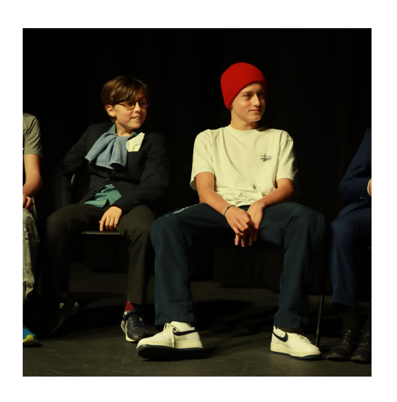
The Haddon Cup