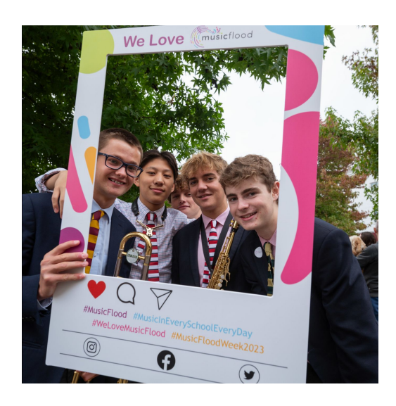
Music Flood Week