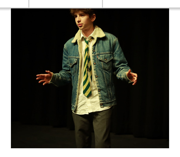
Haddon Cup Winner