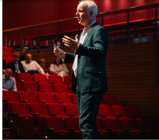
Warden to New Shells