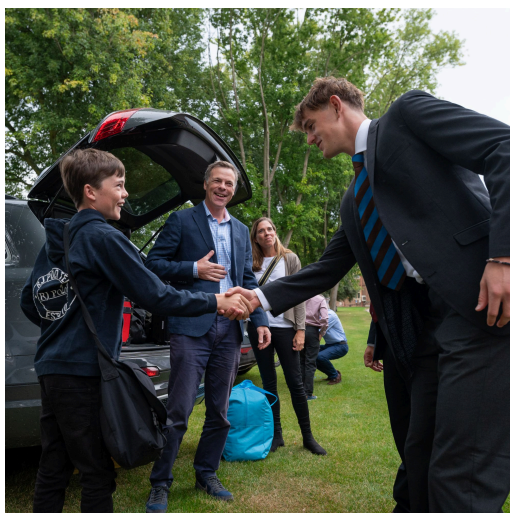
First Day of Term

We are grateful to all of our professional and boy photographers who work hard to capture the true essence of Radley. As ever, all photographs are free to download from Flickr .