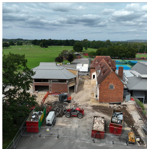
Music School Update