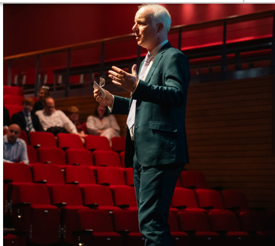
Warden to New Shells