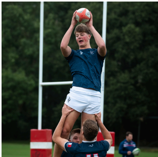
Sport - Tuesday