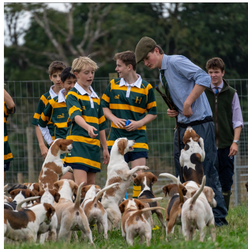
Shell Circus (2)