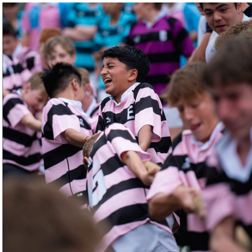
Shell Tug of War