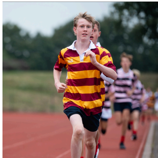
Shell Circus (1)