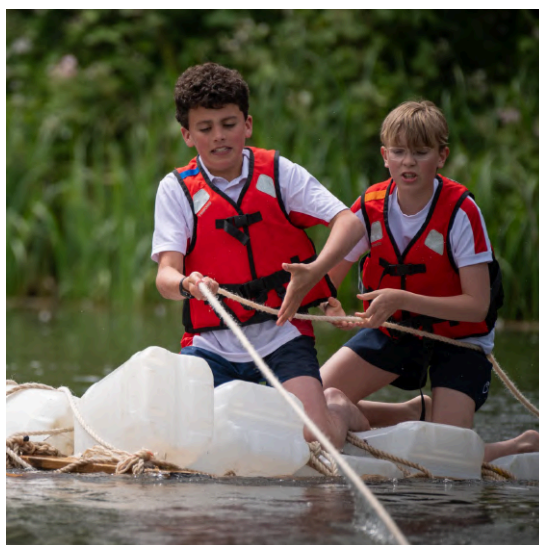
Shell Raft Building