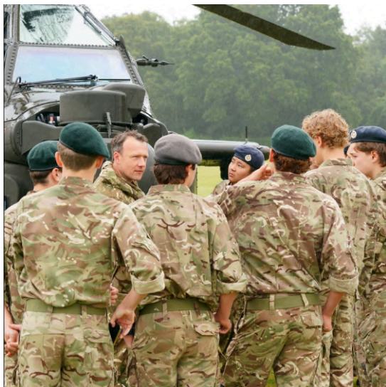
CCF Inspection Day

We are grateful to all of our professional and boy photographers who work hard to capture the true essence of Radley. As ever, all photographs are free to download from Flickr .