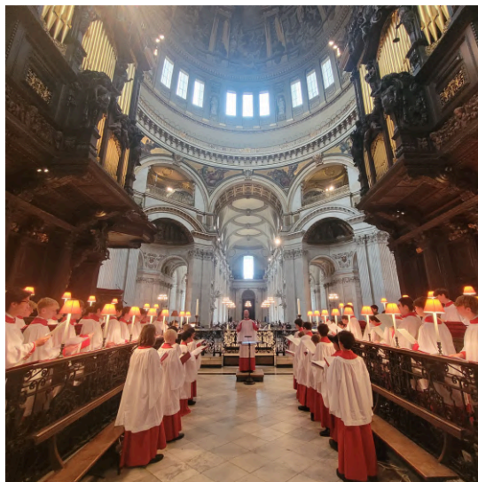
St Paul's Evensong