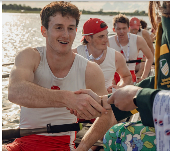
NSR - Sunday