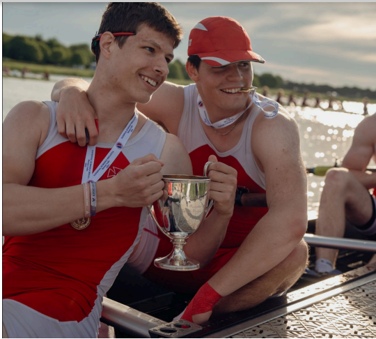
NSR - Saturday