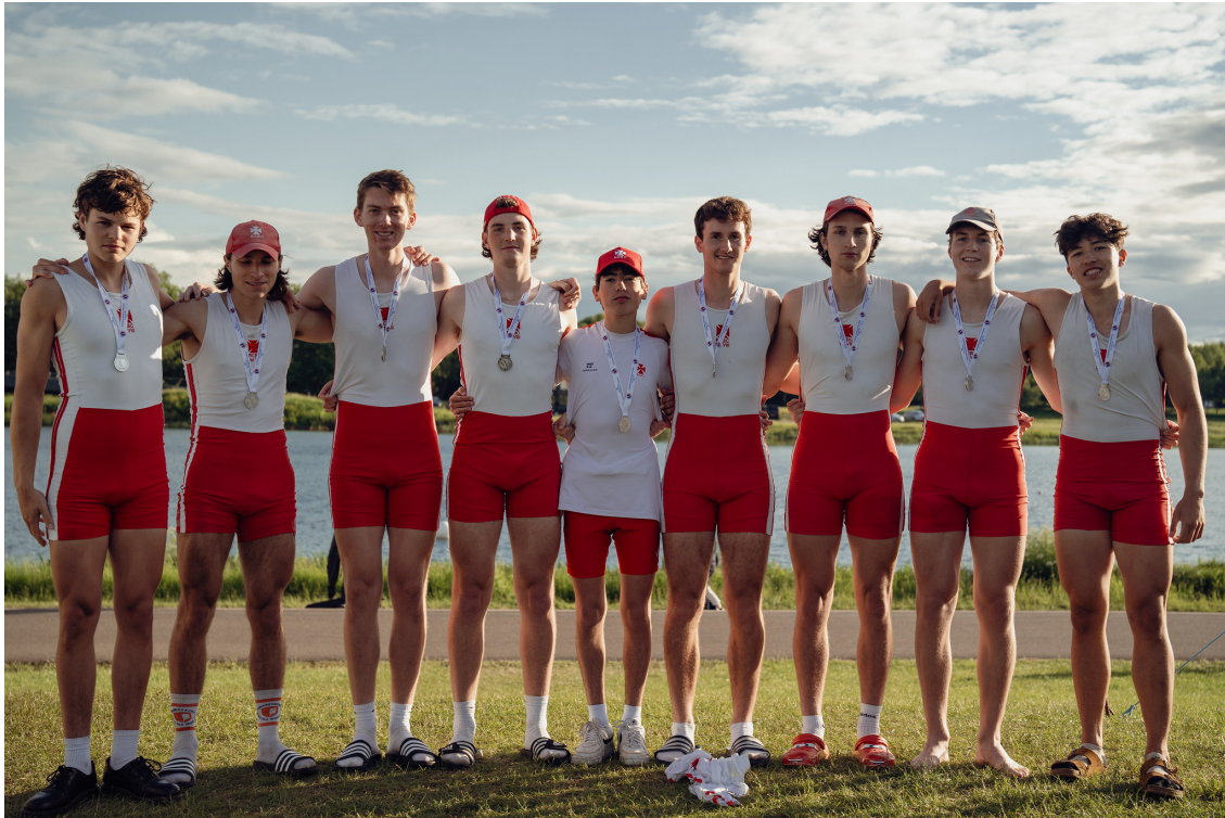
National Schools' Regatta