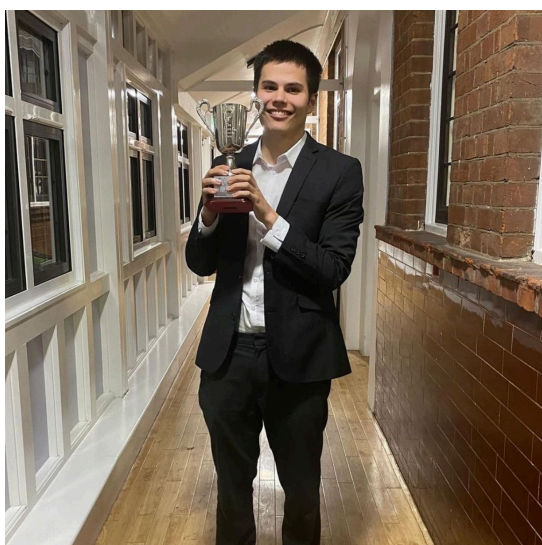
Ferguson Singing Prize