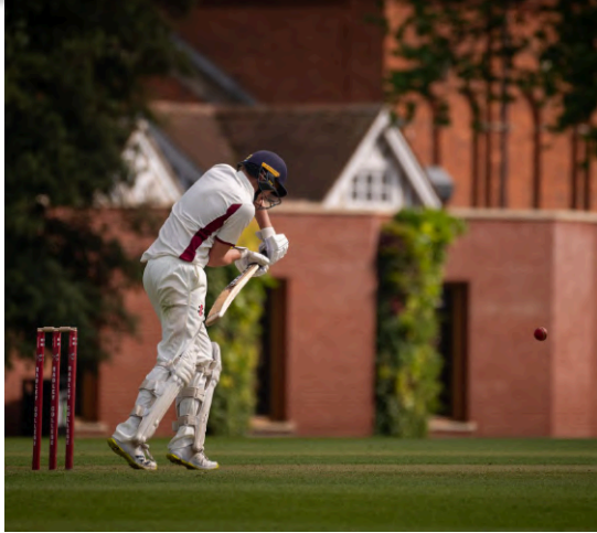
Cricket & Tennis