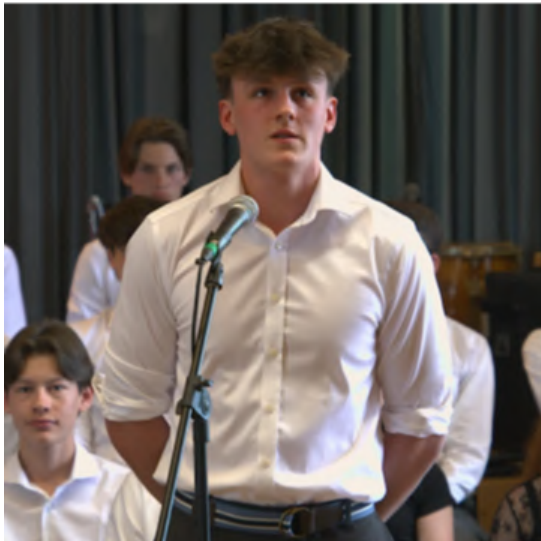
Les Misérables Preview