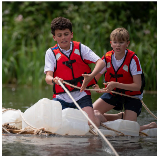
Shell Raft Building