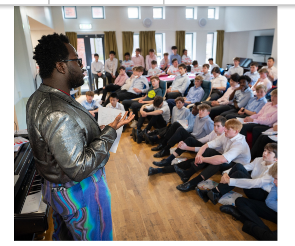
Youth for Youth - J Social