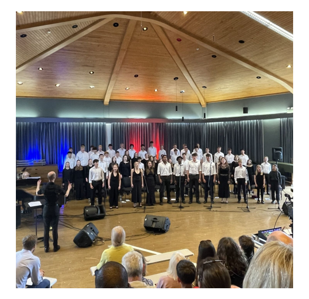
Les Misérables Preview