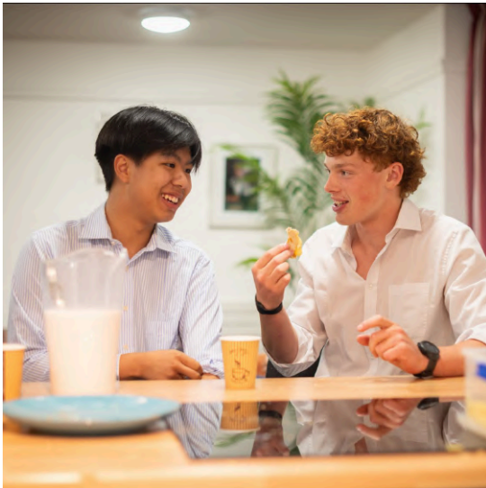
Cocoa - G Social