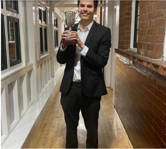
Ferguson Singing Prize