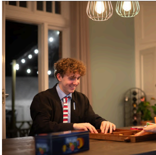
Cocoa - D/H Socials