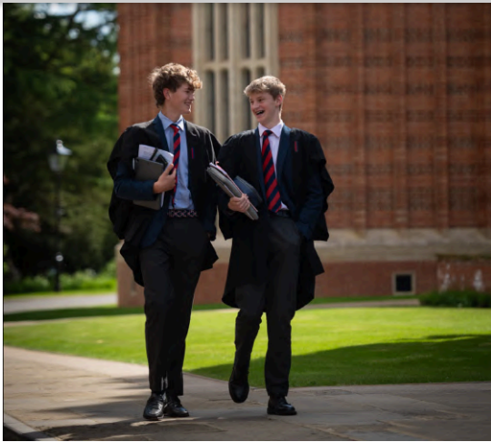
Boys on Campus