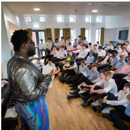
Youth for Youth - J Social