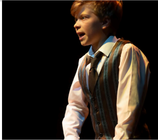
Peter Cook Cup