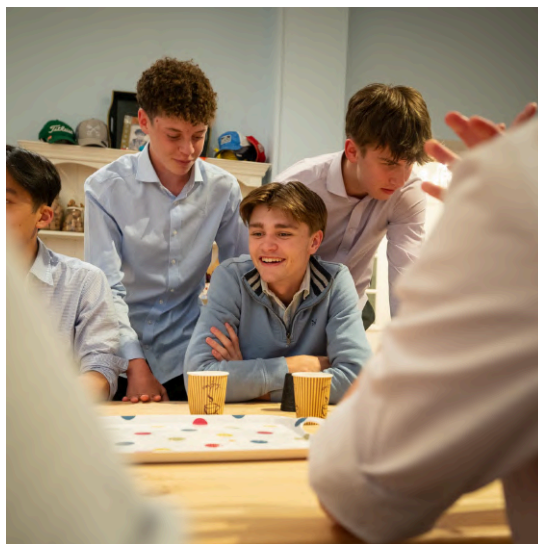
Cocoa - A Social