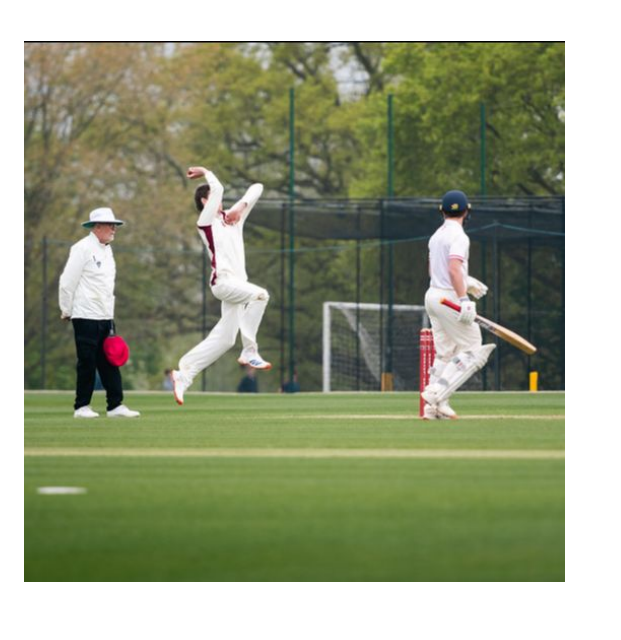
CCF with Downe House